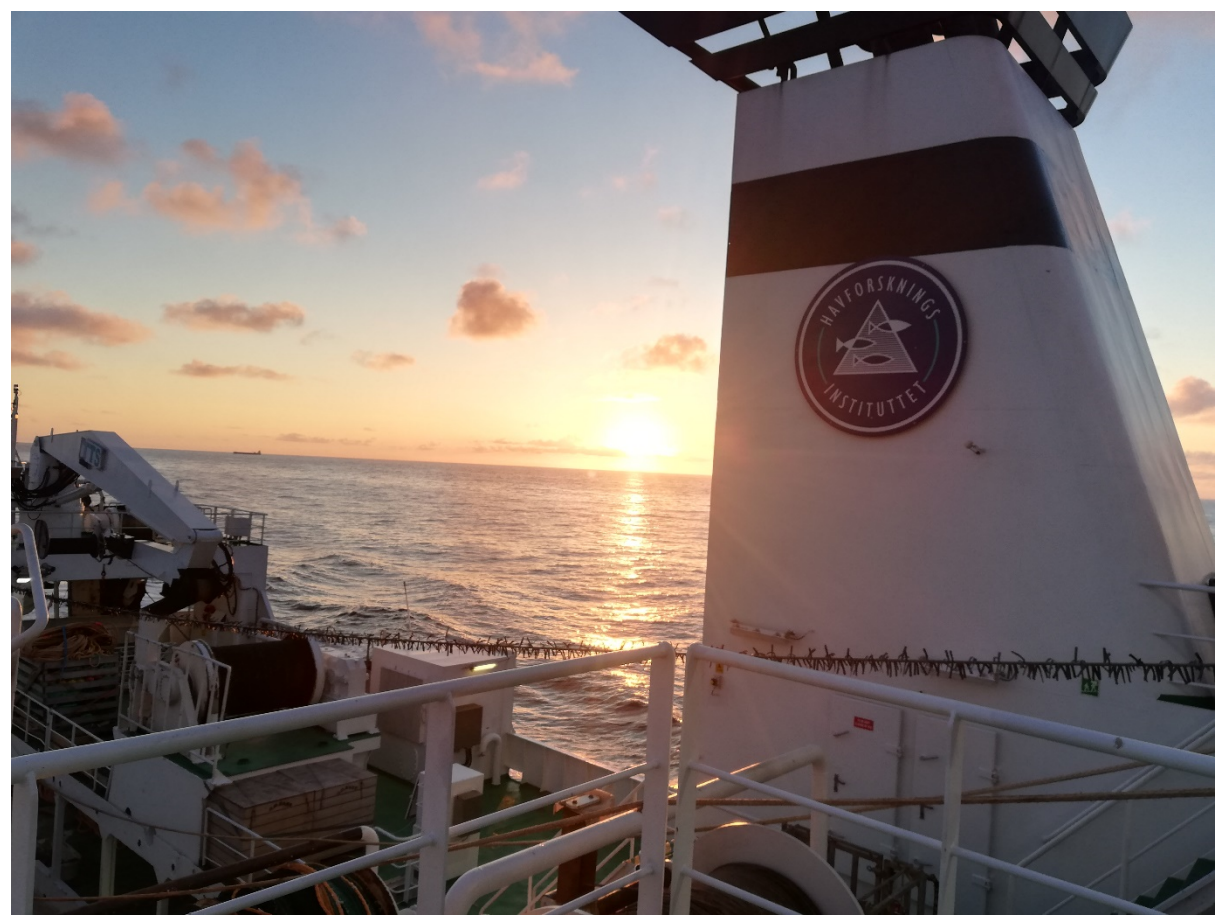
R/V "G.O. Sars", surveying the North Atlantic Ocean mesopelagic sone during the light summer nights.

As part of the MEESO field campaign, the Norwegian Research Vessel, G. O. Sars, is surveying the mesopelagic ecosystem of the North-East Atlantic and the Norwegian Sea. The cruise started in Bergen, Norway, 1 June and ends there 30 June.