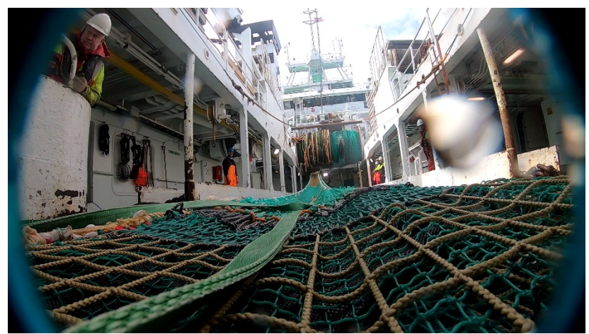
Trawl on deck. Any catch?

During the cruise we used submersible broadband acoustics and optical sensors on the towed platform, MESSOR, to quantify abundance and biomass of mesopelagic organisms down to 1000 m. In combination with non-graded trawls with Deep Vision (cod-end camera system) and new developments in the use of acoustic models, we will improve our knowledge of mesopelagic stock's biomass and their ecological role.