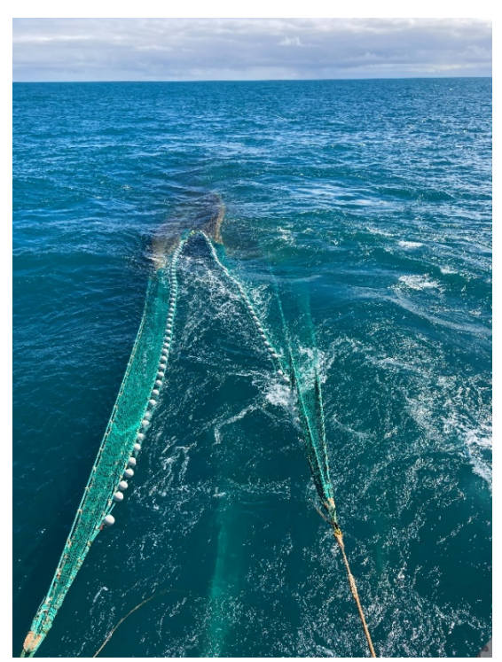
Shooting the 280 Egersund Micronekton trawl. Opening area about 345 m<sup>2</sup>, 16-mm stretched mesh size (7x7 mm mesh opening).

Vertical migration among mesopelagic species is known to be pronounced spanning several hundred meters from daylight till the darkest hours of the night. Although we are now experiencing the lightest nights of the year, we have seen extensive vertical migration and the migrations are recorded by trawls with Deep Vision, Multinet and submersible acoustics on our towed system, MESSOR, down to 1000 m depth.