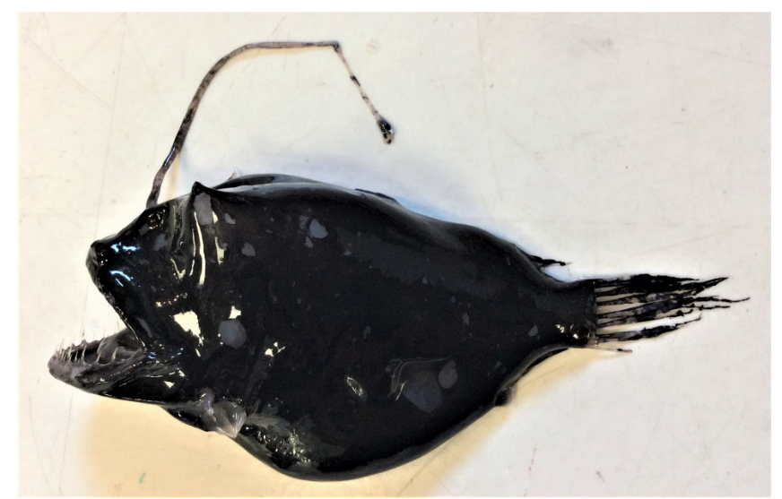
A female Bulbous dreamer Oneirodes eschrichtii (122 mm TL), males of this species are dwarfs, but not parasitic.