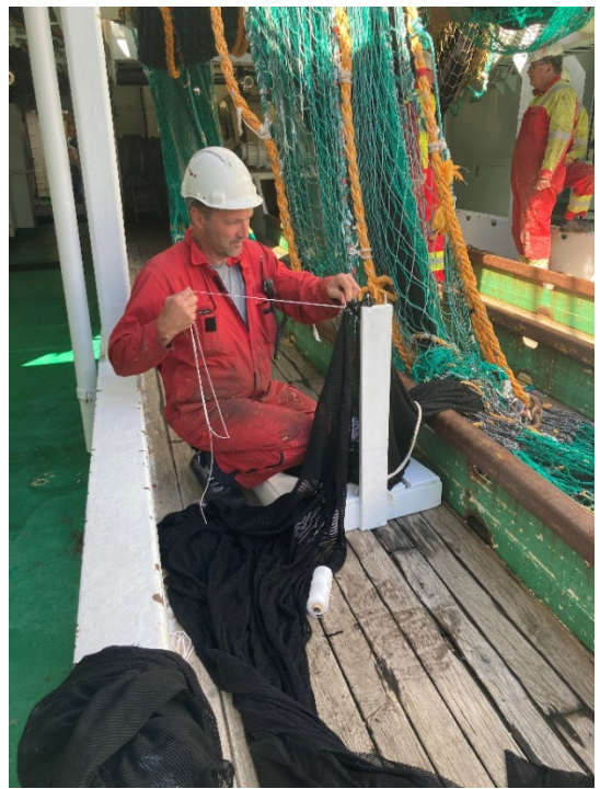
The fishing master repairing the fine meshed trawl.

Vertical migration among mesopelagic species is known to be pronounced spanning several hundred meters from daylight till the darkest hours of the night. Although we are now experiencing the lightest nights of the year, we have seen extensive vertical migration and the migrations are recorded by trawls with Deep Vision, Multinet and submersible acoustics on our towed system, MESSOR, down to 1000 m depth.