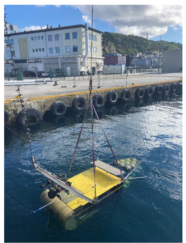
Ålesund harbour. Changing crew and calibrating broad band acoustics on the MESSOR, towed platform.

Abundance and biomass estimation by non-graded trawls: The sampling volume of our trawls are estimated by use of new technology. The height of the trawls is recorded by the difference between two depth sensors at the bottom and top of the trawl, while the width is recorded by Scanmar distance sensors on both sides of the trawl walls. This gives the opening area of the trawl, while the flow into the opening is continuously recorded by an ADCP mounted on the trawl footrope, heading upwards.